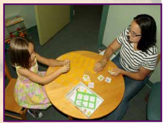
At The Family Place CAC, children receive the counseling they need to emerge healthy and thriving from an abusive situation.

multi-disciplinary team that focuses specifically on the investigation, prosecution and victim services for all sexually based offenses against children and adults, as well as serious child abuse.