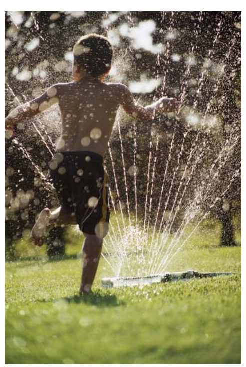
The Family Place 2008